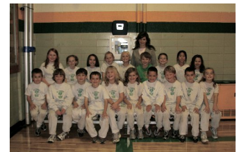
2nd Grade Students of St. Francis of Assisi School posing in front of their new AED