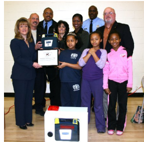
Police Athletic League AED Donation