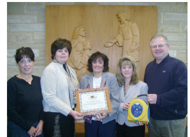
Villa Joseph Marie High School AED Donation

Thanks to Cardiac Science.... for their donation of an AED to the Savino Foundation. The unit was re-donated to the Philadelphia Police Athletic League and it now resides in their Lenfest Center. The Savino Foundation funded CPR/AED training at the facility.