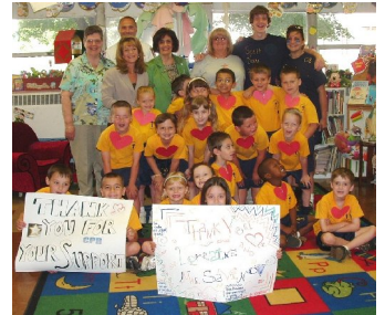
St. Thomas Aquinas School CPR/Training Donation

Thanks to Cardiac Science.... for their donation of an AED to the Savino Foundation. The unit was re-donated to the Philadelphia Police Athletic League and it now resides in their Lenfest Center. The Savino Foundation funded CPR/AED training at the facility.